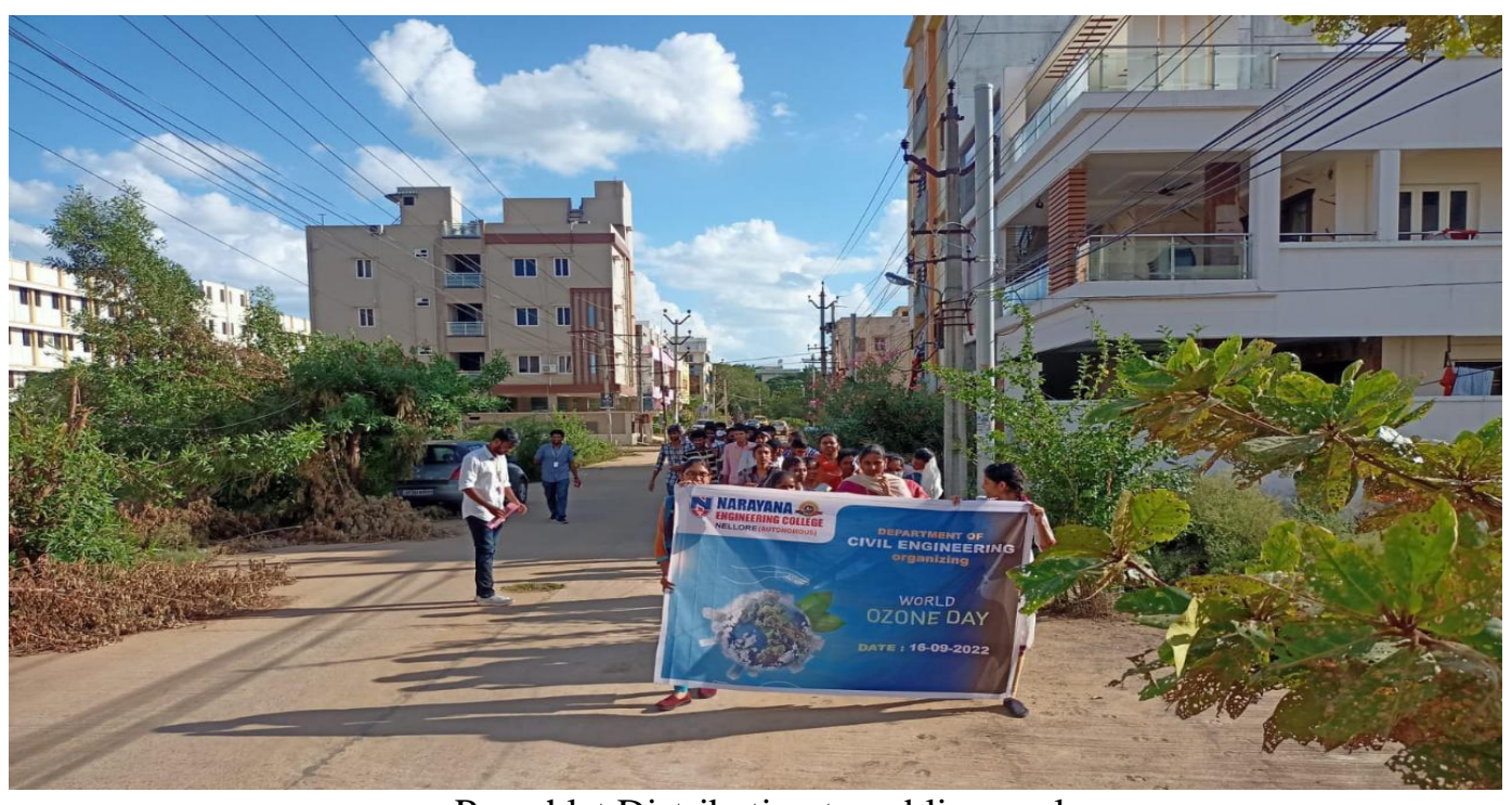
Pamphlet Distributing to public people