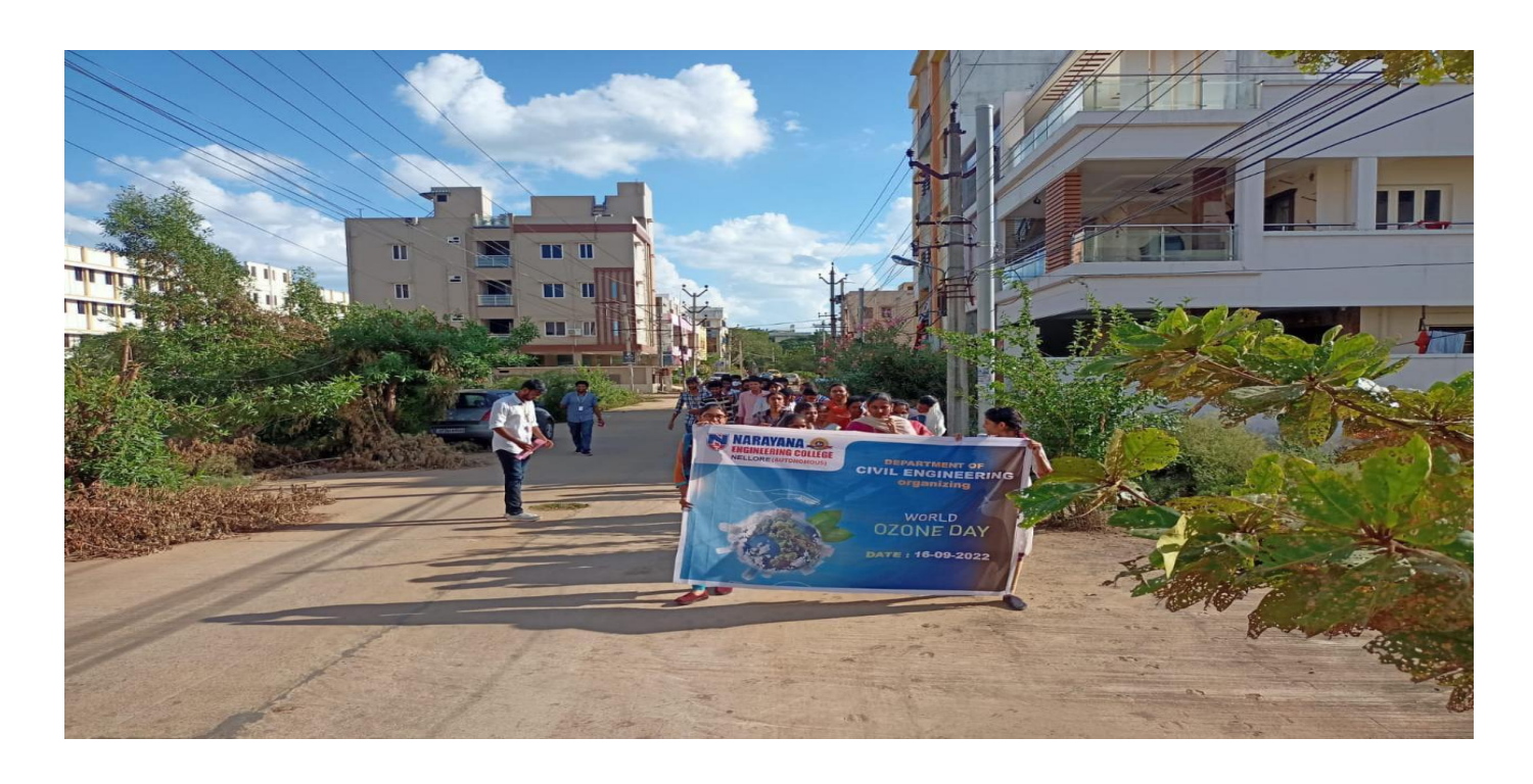
Students rally from Narayana Eng. College to harinath puram 4<sup>th</sup> street