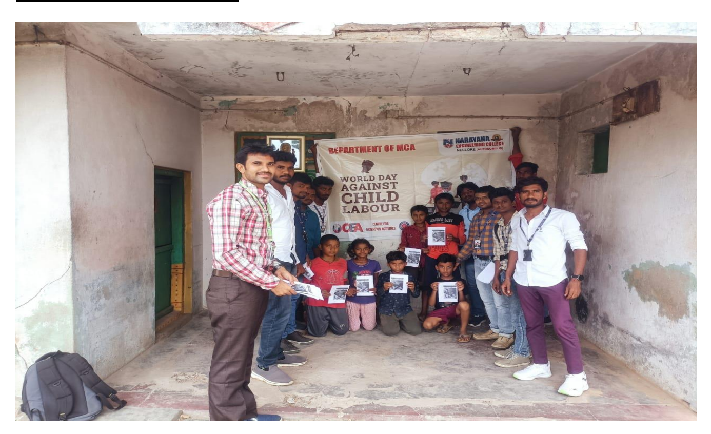
MCA Students and staff with child labours at Chintareddy Palem Village, Nellore City Rural area.