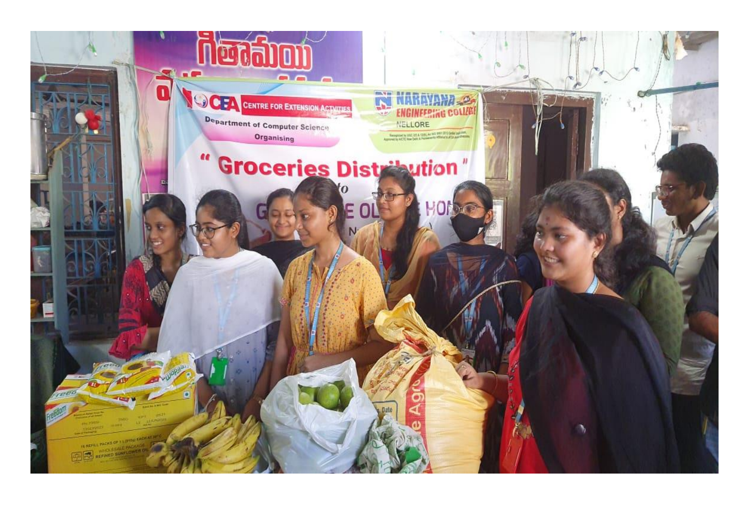
CSE students distributing groceries to aged people in Gitamayee Oldage Home, Balaji Nagar, Nellore