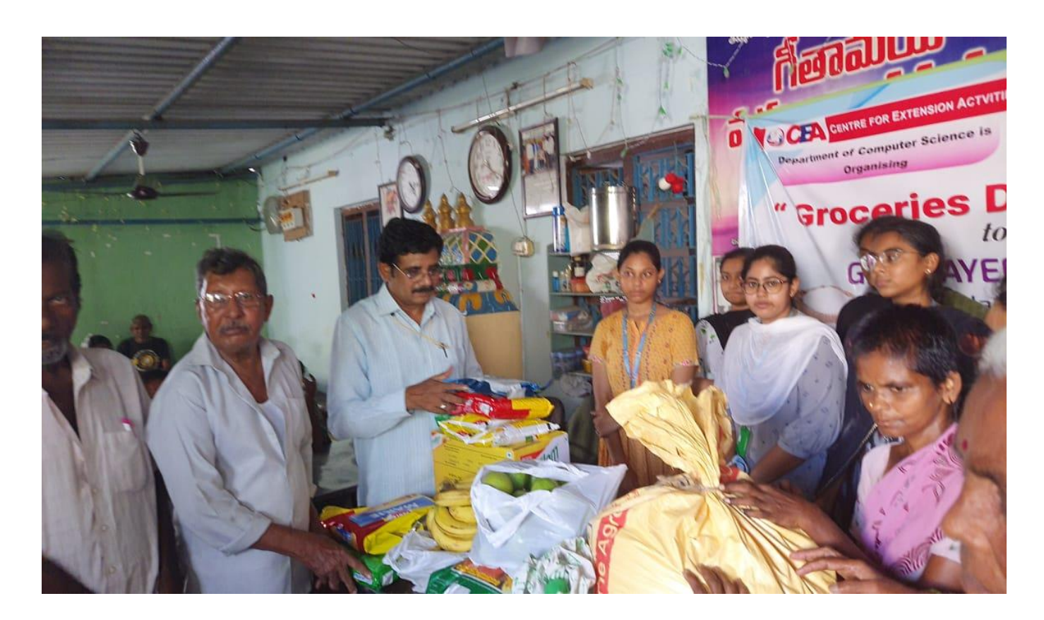
CSE students & HOD standing in front of Gitamayee Oldage Home, Balaji Nagar, Nellore with groceries