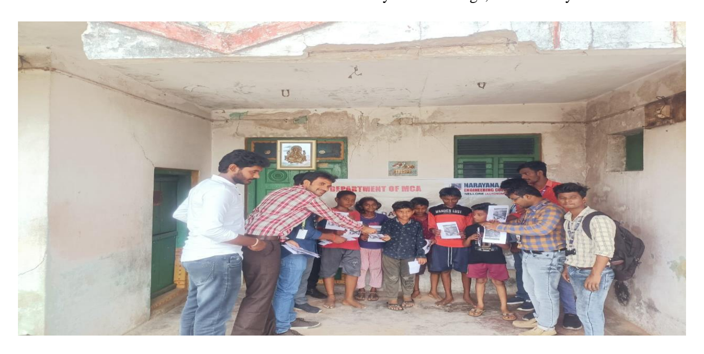
MCA students and staff distributes World Day against Child Labour phamphlets to child labours