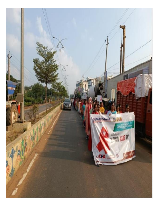
Students participating in the Rally and Creating Awareness in the society